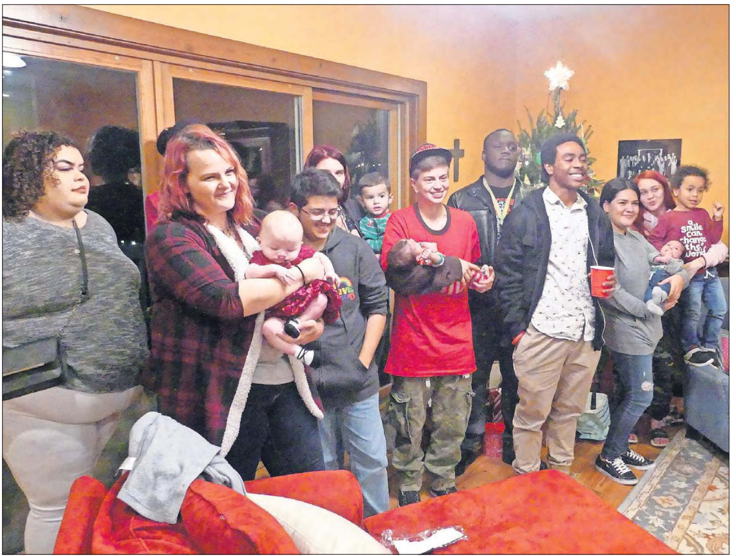
Some of the clients of Forward Paths pose for a group photo during their Christmas party at the home of its founder.