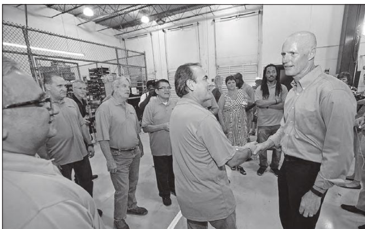
Florida Gov. Rick Scott, right, shakes hands with employees at Aerospace Precision after a tour of the repair facility to highlight job growth in Florida, Tuesday, July 7, 2015, in Hollywood, Fla.

The latest numbers from the Department of Economic Opportunity — based on separate